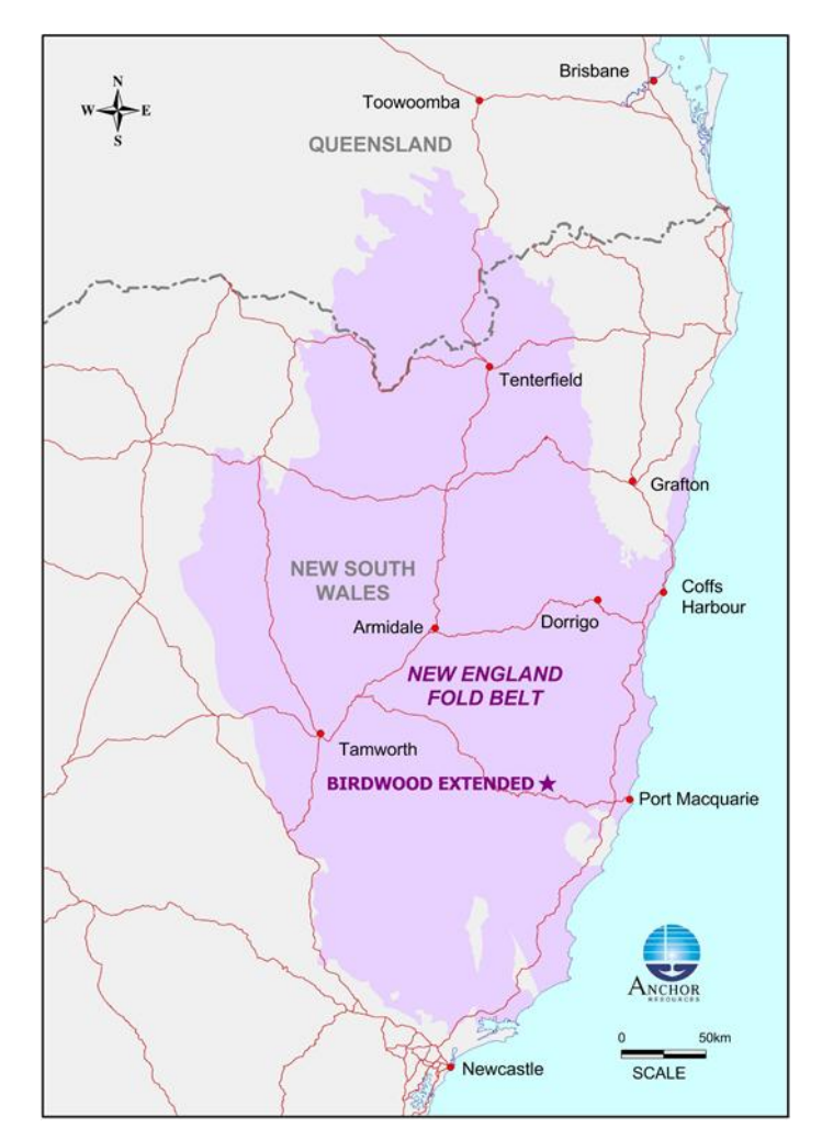
Figure 1: Birdwood project location

The Birdwood project is located in the southern portion of the New England Fold Belt in northeast New South Wales, centred 50km west of Port Macquarie (Figure 1). It includes the Birdwood North copper prospect and several other base metal mineral occurrences.